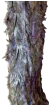
Discoloration and Burns