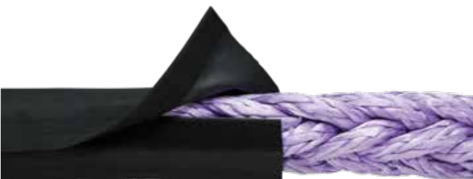
PNW available in tubular form, or hook-and-clasp

Durability is also an important factor of overall line cost. With the addition of anti-chafe gear such as pendant and anti-chafe covers, the useful life of lines can be significantly increased, creating maximum cost efficiency with minimal maintenance. For further details on our Chafe solutions, refer to our Chafe Protection brochure.