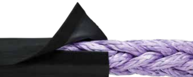
PNW available in tubular form, or hook-and-clasp

Durability is also an important factor of overall lifting sling performance. With the addition of anti-chafe guard protection, the useful life of slings can be significantly increased, creating maximum cost efficiency with minimal maintenance. For further details on our Chafe solutions, refer to our Chafe Protection brochure.